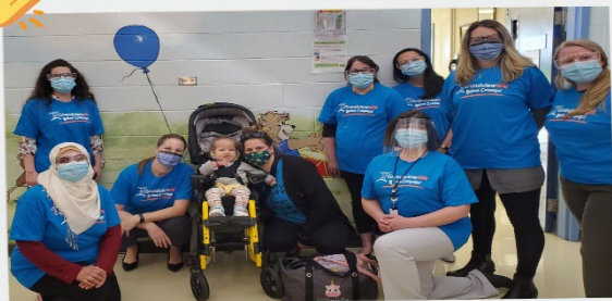
Grandview Kids launches the Durham Paediatric Complex Care Clinic!