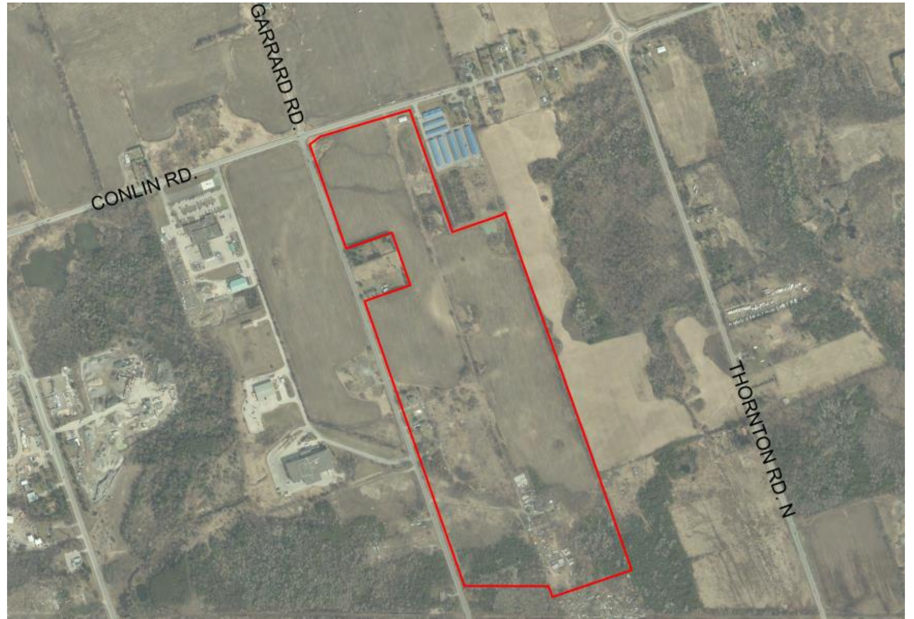
Aerial Image of the Subject Lands