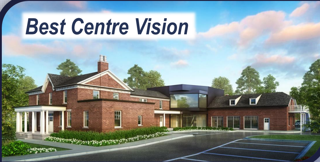
Best Centre Vision