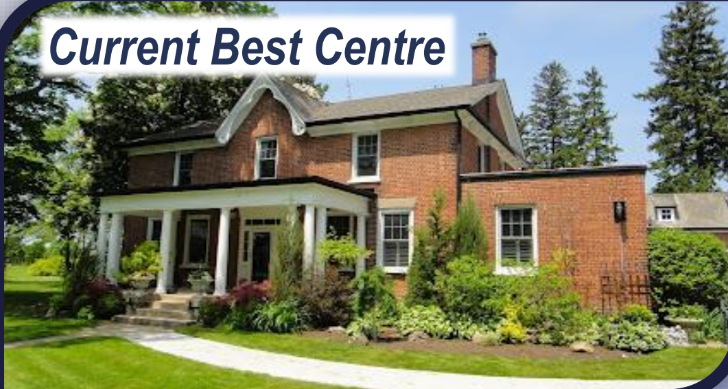
Current Best Centre