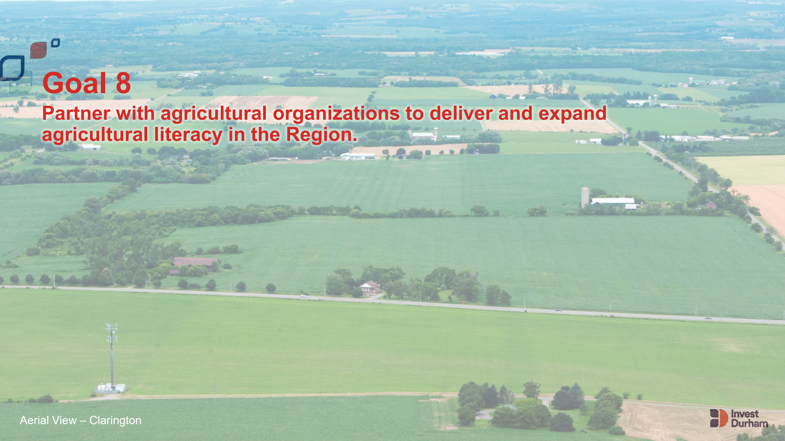
Aerial View – Clarington

Partner with agricultural organizations to deliver and expand agricultural literacy in the Region.