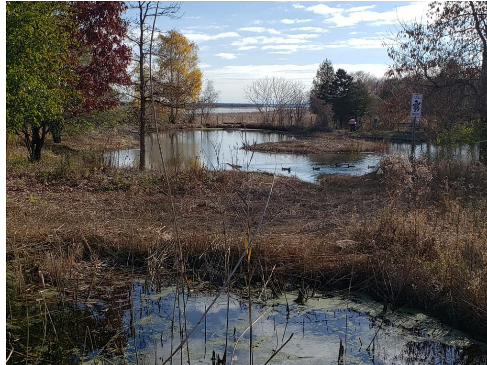
Left: Phragmites growth in Dogwood Pond.