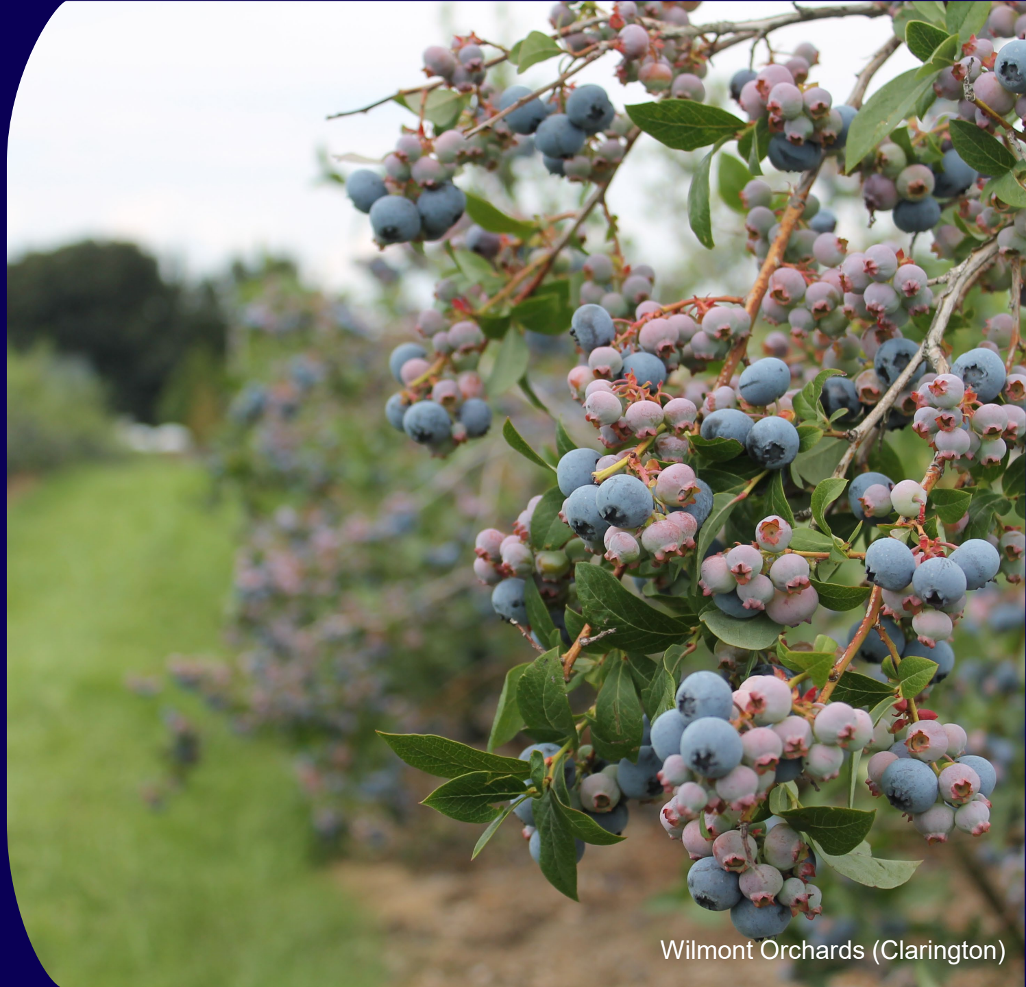
Wilmont Orchards (Clarington)