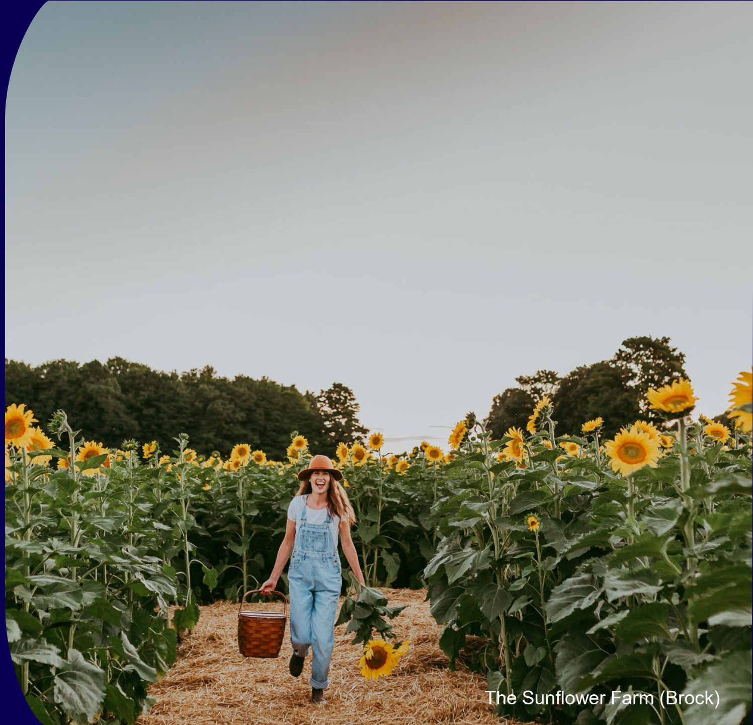
The Sunflower Farm (Brock)