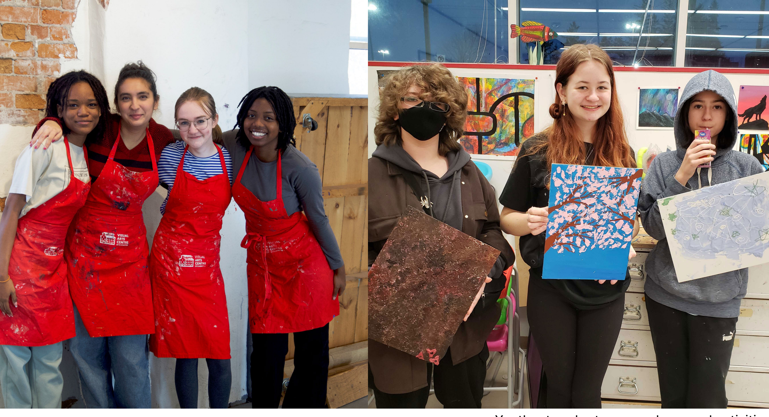
Youth arts volunteers, workers, and activities