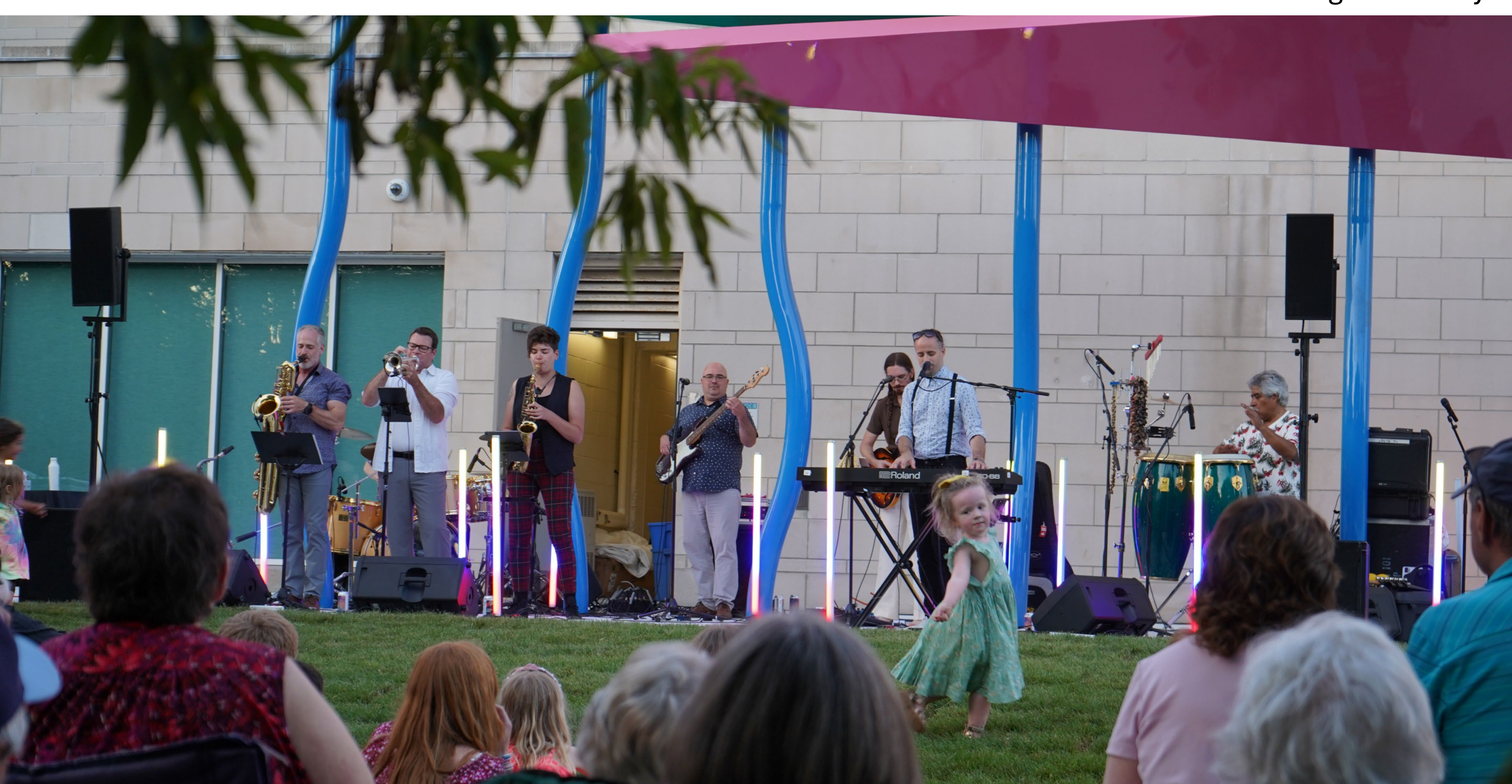
The Robert McLaughlin Gallery