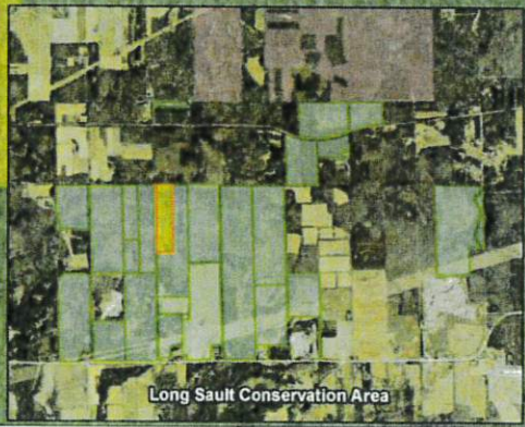
Long Sault Conservation Area