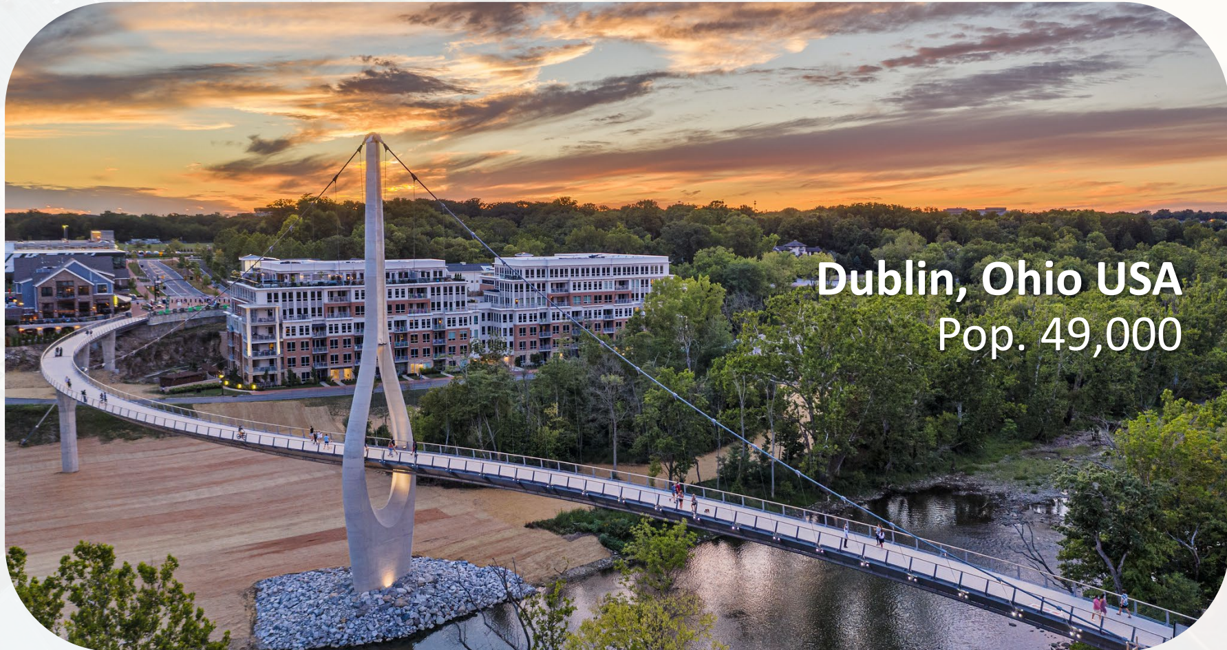
Dublin, Ohio USA Pop. 49,000