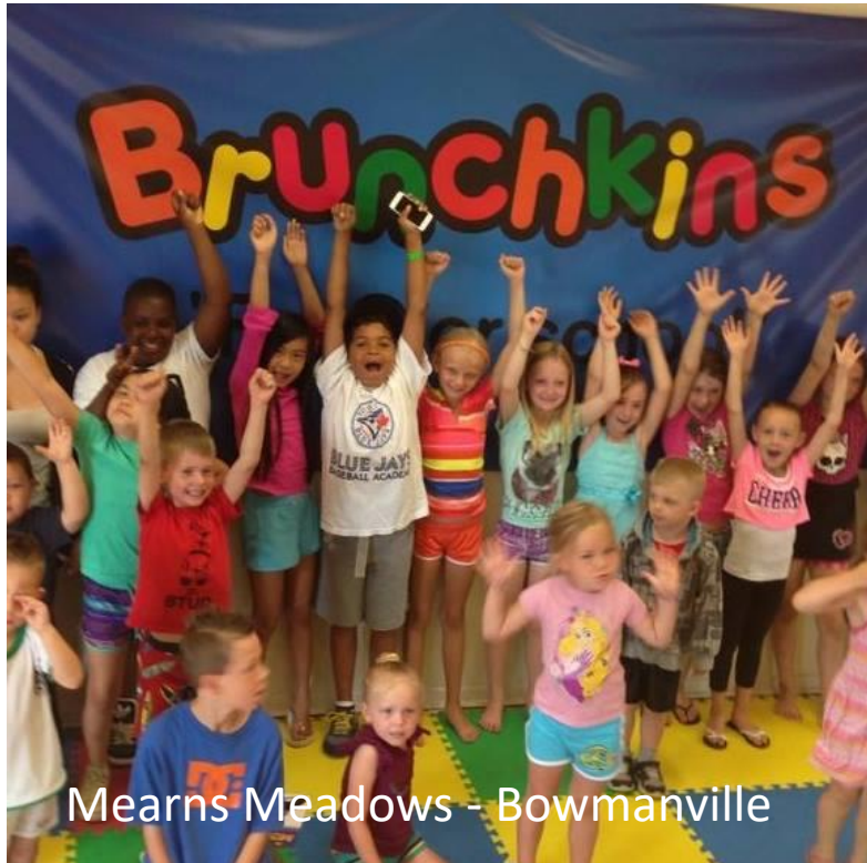
Mearns Meadows - Bowmanville