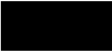
Mayor Annette Groves